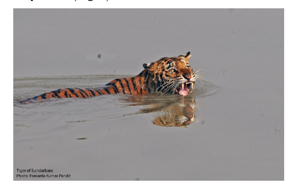
Fig-1: Tiger of Sundarban Tiger Reserve

The tiger of Sundarban is the world renowned Royal Bengal Tiger ( Panthera tigris tigris ). Its claws are adapted to strike and hold prey canines are designed for biting and killing; short strong jaws are controlled by powerful muscles, soft pads for steadily approach make the tiger capable of sudden speed and burst of power (Fig-1).