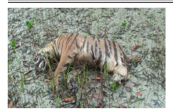
Fig-2: Tiger of Sundarban.