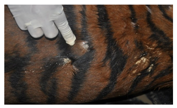
Fig-4 : Elliptical deep piercing wound on the body.

It is combined with highly developed sense of hearing and vision. However its power of smell has been found to be not as powerful as the hearing ability. Its unique striped colour of deep yellow orange and black are variable. Sundarban tiger in different from any other tiger in the country and world because of its adaptability to the unique mangrove habitat. Their behaviors are highly individual