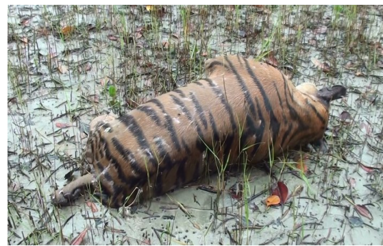
Fig-3: Hind portion of the tigrees eaten by crocodile.

It is combined with highly developed sense of hearing and vision. However its power of smell has been found to be not as powerful as the hearing ability. Its unique striped colour of deep yellow orange and black are variable. Sundarban tiger in different from any other tiger in the country and world because of its adaptability to the unique mangrove habitat. Their behaviors are highly individual