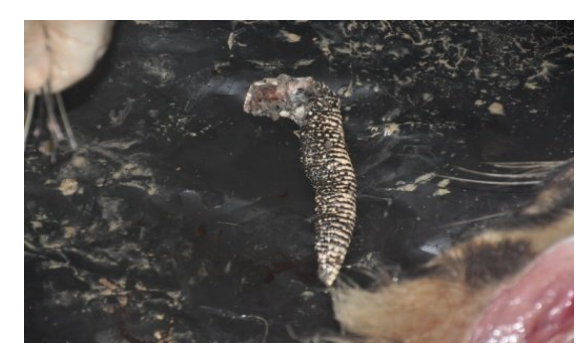
Fig-5: Tail portion of water monitor lizard within the oesophagus.

specific and can't be generated or replicable (Mukherjee, 2004).