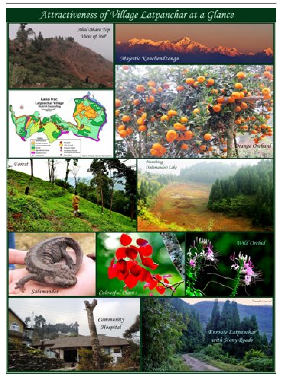
Fig. 2 Environmental scenario of Latpanchar village

Indian Journal of Geography and Environment, 13 (2014)