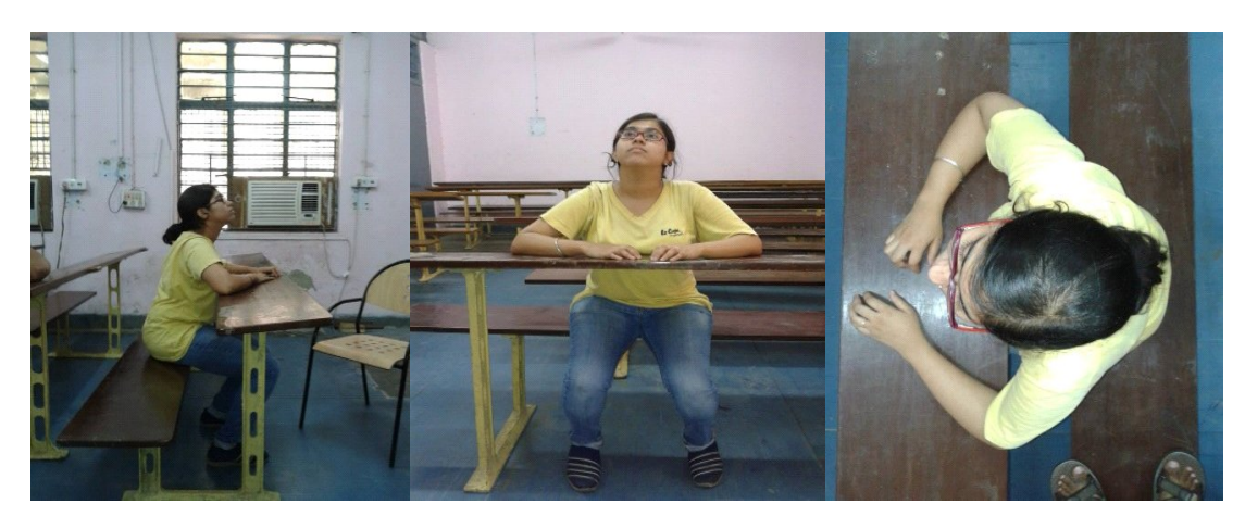
Fig 1: Right, front and top view of a subject for REBA analysis

Method followed: Pictures of all the subjects were clicked by using a "Nikon D3100" DSLR camera in three different angles- front, right and top view. These were then analysed using a computer application "Ergo Fellow" by FBF SISTEMAS to ascribe REBA scores.