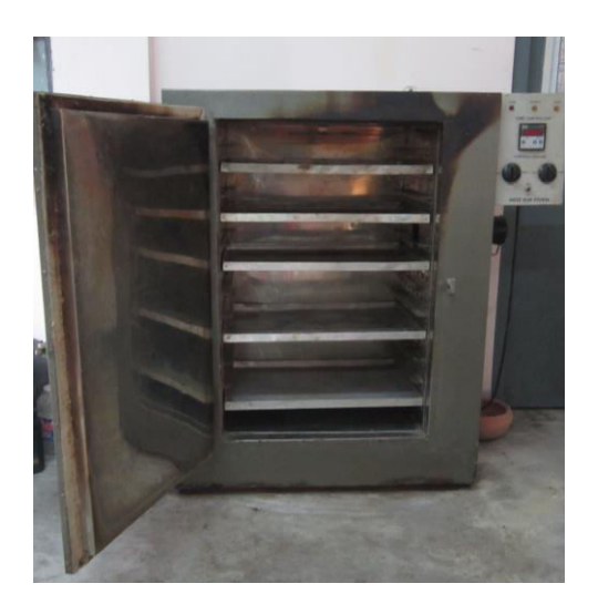
Plate No. 4