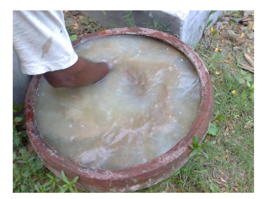
Plate No. 10