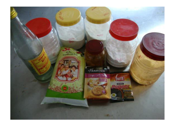
Plate No. 11