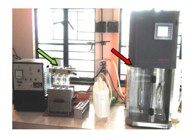
Plate No. 2