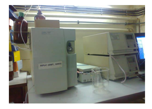
Plate No. 3