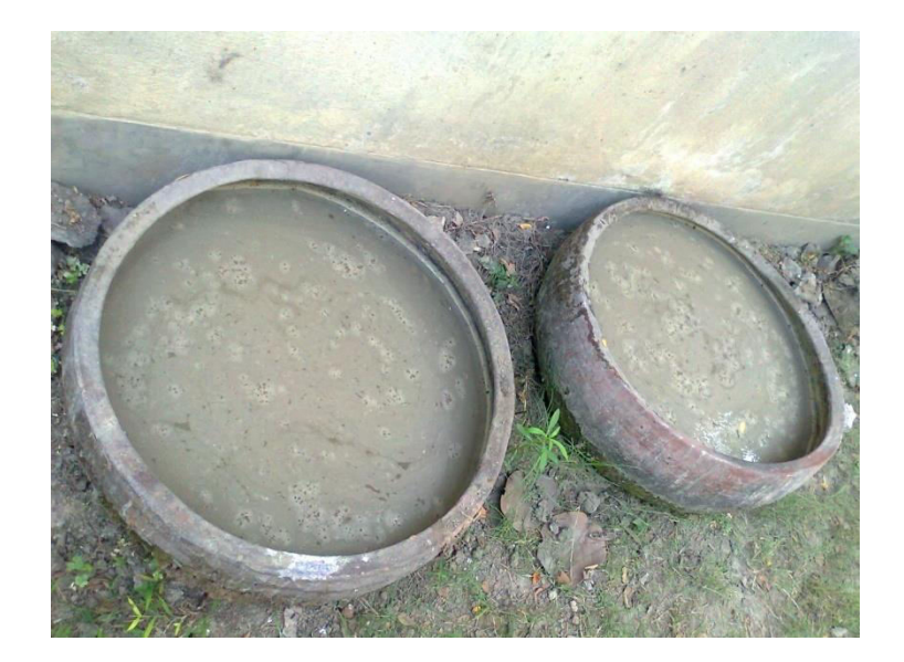
Plate No. 5