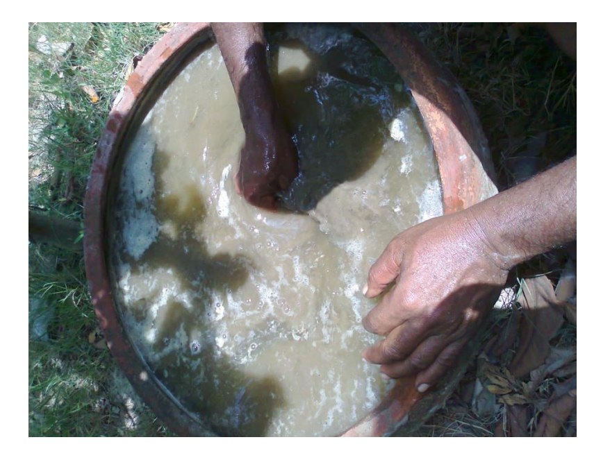
Plate No. 8