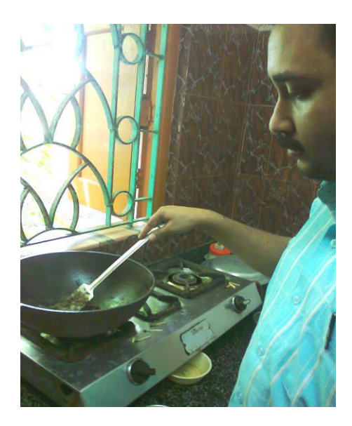
Plate No. 13