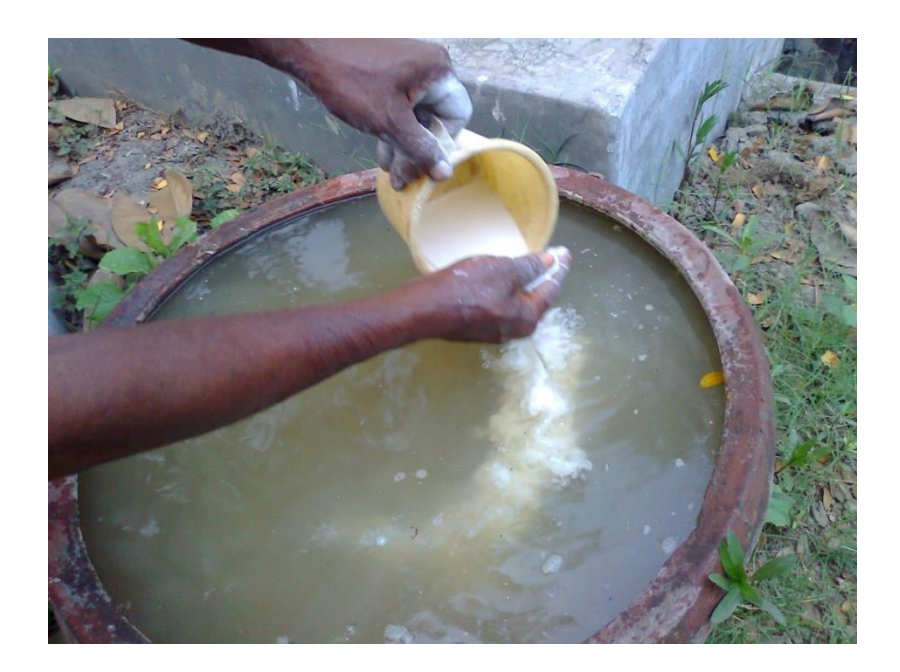
Plate No. 9