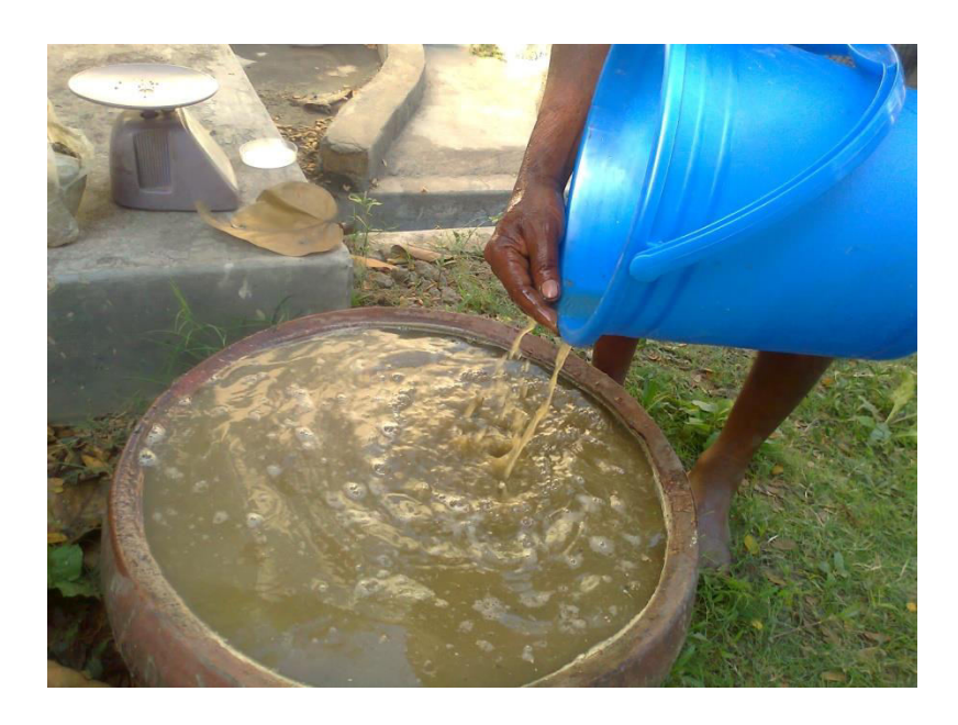
Plate No. 7