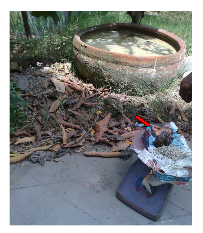
<u>Plate No. 6</u>