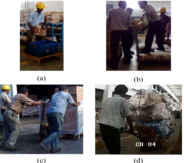
Fig 3: MMH task at different locations- (a) Lifting-carrying at location-3, (b) Lifting at location-15, (c) Pushing between location-5 & 18, (d) Pulling between A1 & 1

The task durations in the current study varied from 1 to 32 min. The biomechanical assessment of the MMH tasks made here through 'peak' joint load estimation has identified the exertion levels of the MMH tasks. The question of physiological effect due to the MMH tasks remains to be addressed.