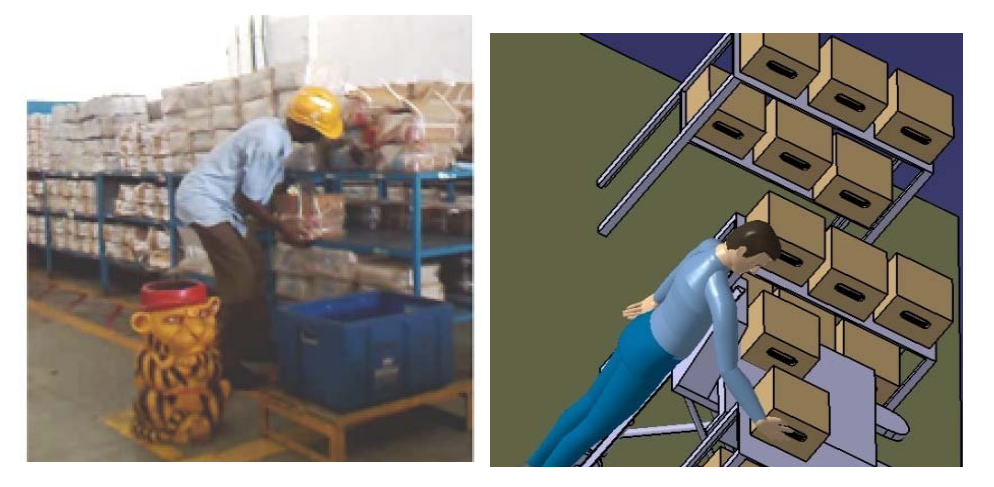
Fig 4: Existing location-3 and redesigned location-3

Ergonomic solutions: The ergonomic solutions provided to the company studied are from analysis through biomechanical assessment. As an example the ergonomic solution for location 3 is described here. The issues identified were heavy box weight, low aisle width, long distance push/pull, and unfavorable origin and destination heights.