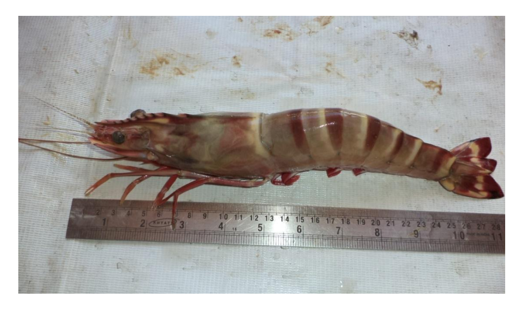
Plate 1.1. Penaeus monodon

Scientific name: Penaeus monodon (Fabricius 1798) (Plate 1.1)